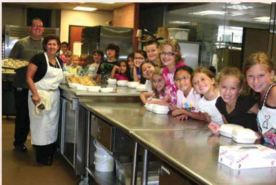
Instructors and children enjoy Kids in the Kitchen offered by Camp College.