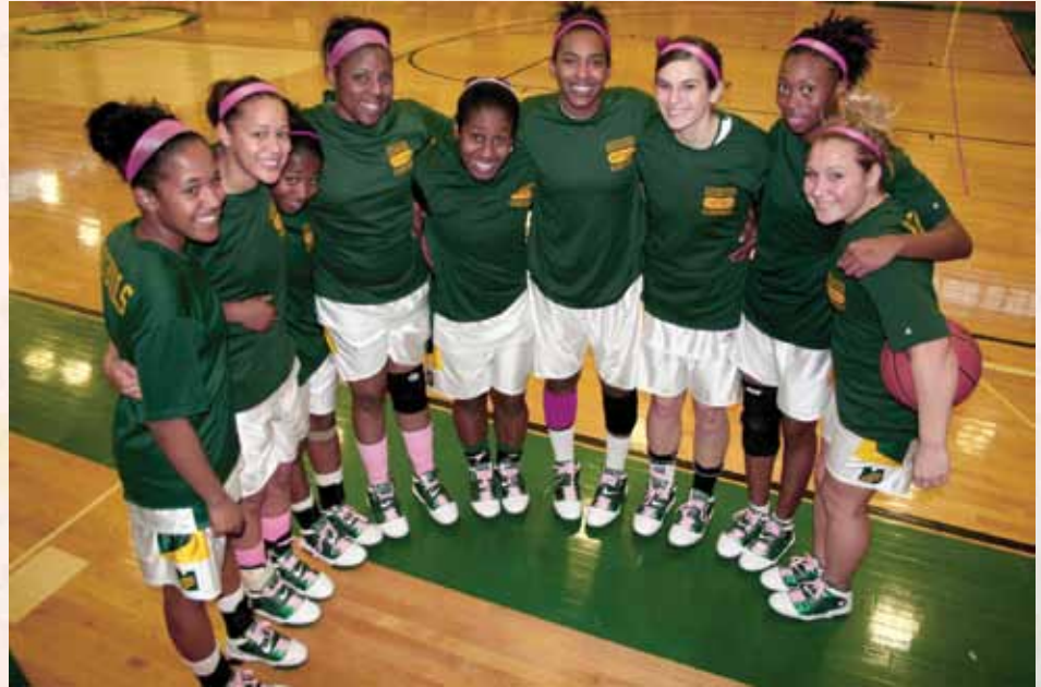
Members of the women's basketball team rallied around the cause of breast cancer awareness in February, donning pink sneakers and headbands in a benefit game dedicated to the Breast Cancer Resource Center in Princeton.

The college welcomes all potential students, recognizing and addressing all student concerns and needs as it seeks to promote student learning, academic success and overall well-being.