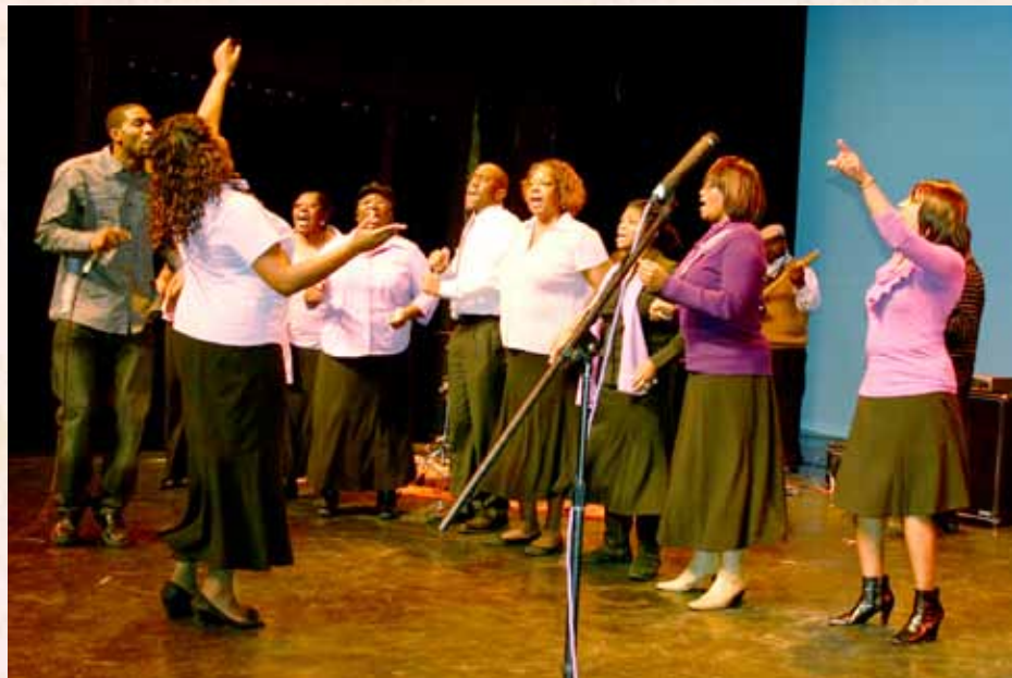
The "Gospel Explosion" performed at Kelsey Theatre during African American History Month.

The college maintains a community culture that embraces the values and experiences of staff, students and all those potentially served by the institution. Communication within this diverse community utilizes a variety of modes that operate top-down, bottom-up and laterally, and reach all individuals affected.