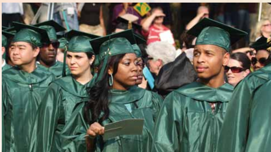
Graduates participate in Commencement 2011.

New Advisor Trac software now enables the college to provide a unified system to track visits to the Advisement Center and to report on student activity. Advisors are able to see each student’s advisement history, enabling more consistency and continuity throughout the process.