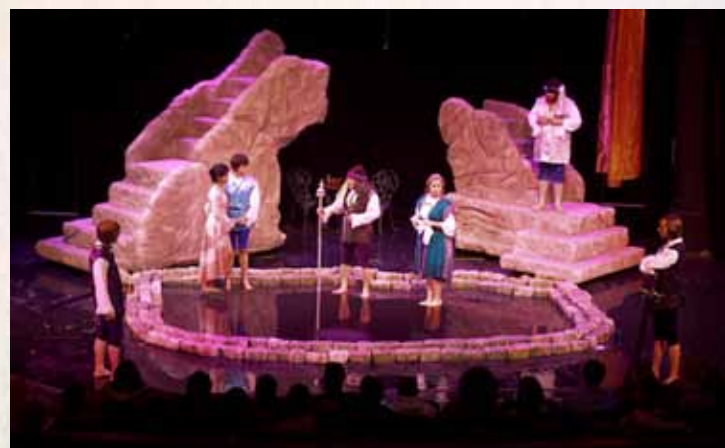
MCCC Theatre students perform Shakespeare's "The Tempest."