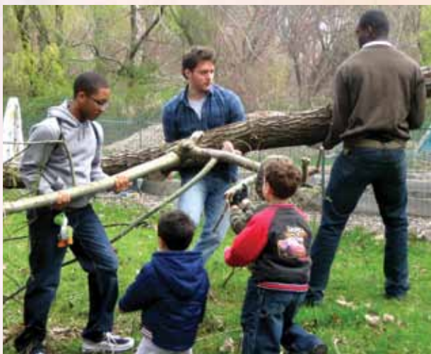
Mercer students joined with students at Bergen Community College and a local pre-school for a clean-up day.