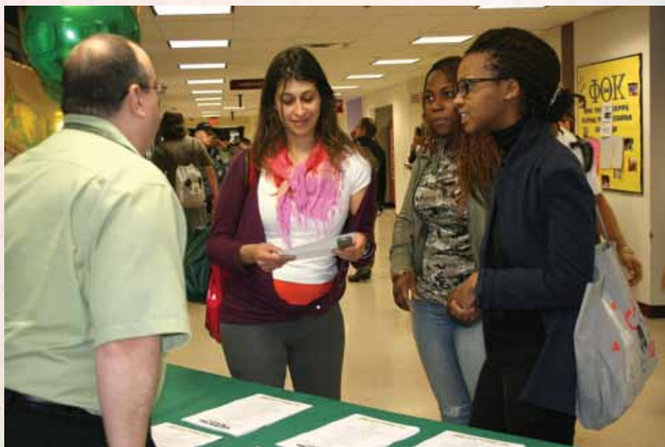
Students learn about ways to serve the community during Volunteer Week.

In addition to associate degree programs, the James Kerney Campus meets the needs of the community through an array of non-degree programs for all levels of learners, including Adult Basic Education, GED preparation, the English Language Institute, the Career Training Institute, and Youth College programs.