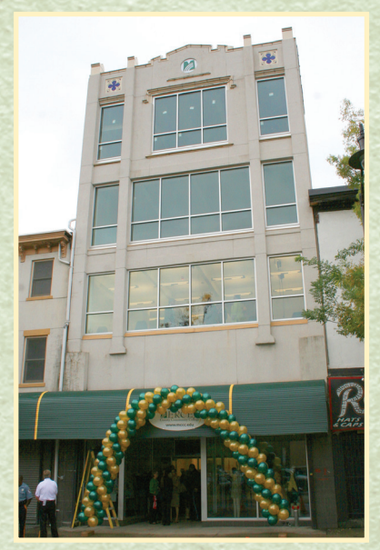
Foundation support helped with the purchase of Trenton Hall.

With new space comes the opportunity for program expansion. Trenton Hall gives Mercer the ability to offer more classes and more degree completion options in the city.