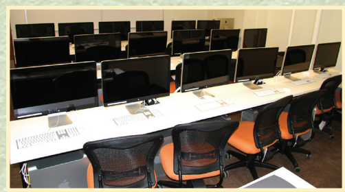
The new Mac lab in Trenton Hall.

The Foundation received a second consecutive $20,000 gift from Bristol-Myers Squibb to expand science education at MCCC's Trenton campus. New labs provide opportunities for more students to take core science classes and provide highly motivated science students with the facilities they need to excel.