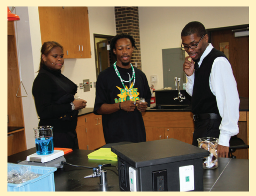
Students visit the new Chemistry lab at the Trenton campus.