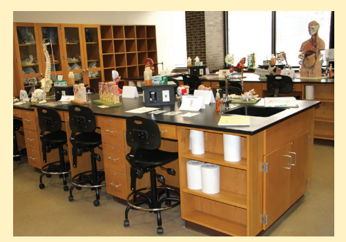
The new Biology lab in Trenton.