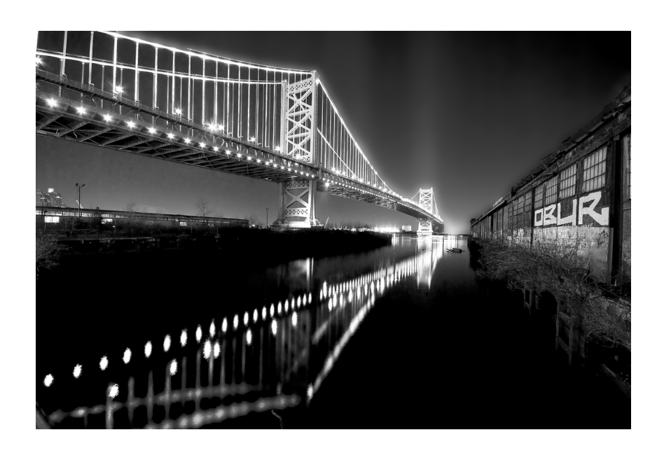
—2 Bridge Lighter blur Chris Szakolczai