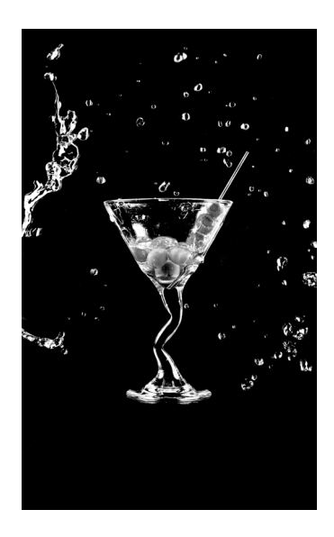
Fall 2010 Volume XXIX