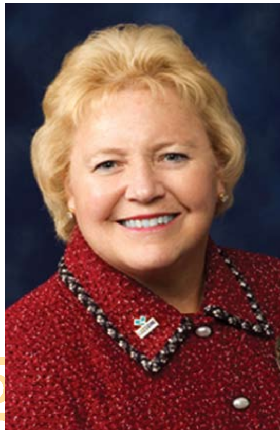
Administration, from the University of Missouri, Kansas City.

She holds an A.B. in Mathematics from Duke University. She earned an M.A. in Mathematics Education and a Ph.D. in Curriculum and Instruction, with emphasis on Education