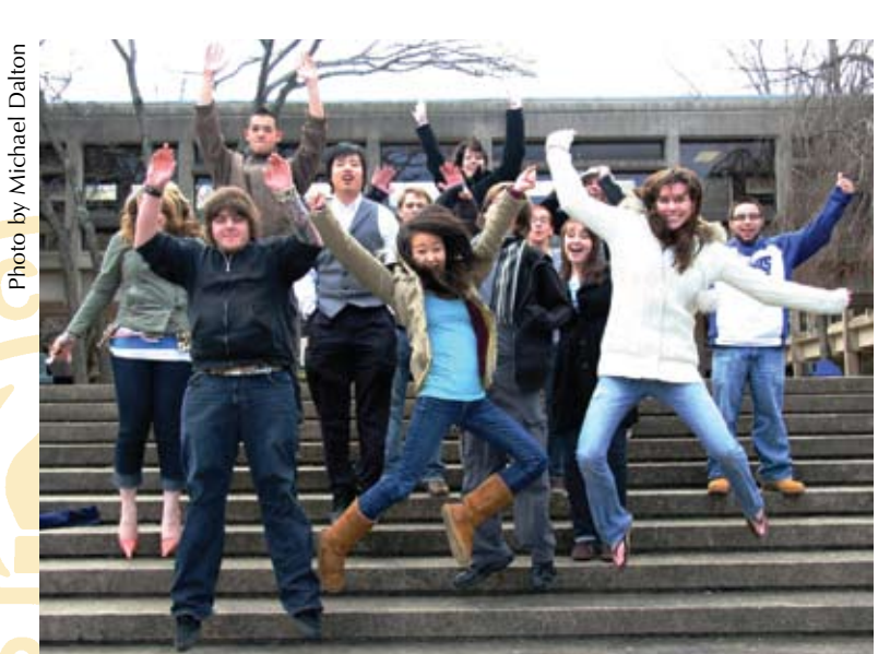
Exuberant staff members from The College Voice