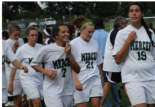
Women's soccer was all about teamwork and a can-do attitude.

Facing Burlington County College for the Region 19 title, the Vikings exhibited their resilience, strength, skill and teamwork. Again, they faced an opponent they had lost to earlier in the season, a 3-0 defeat on Sept. 20. This time they battled through 90 scoreless minutes and an additional 30 minutes of overtime,