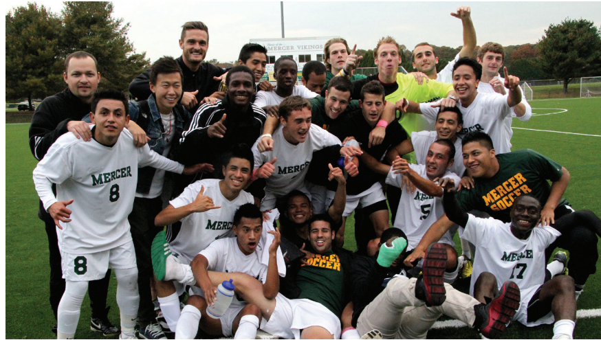
The men's soccer team is pictured after defeating Essex CC in the Region 19 semifinal, played at the MCCC Stadium. This season the Vikings recaptured the Region 19 title.

ton on Oct. 27, the third consecutive season the Vikings faced the Barons for the title. (BCC defeated MCCC 3-2 last year and Mercer won 1-0 in 2010.) In September, Burlington had beaten the Vikings 1-0, so the Barons may not have realized what they were up against facing a revitalized Mercer squad.