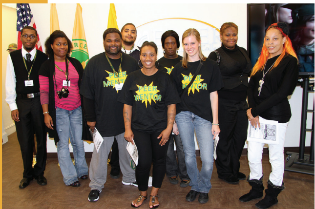
MCCC student tour guides.